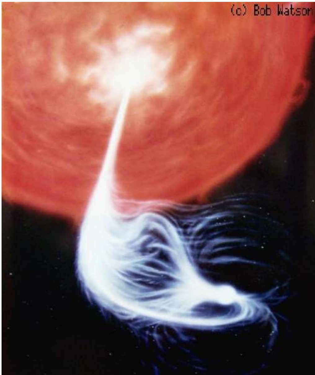
Figure 1. The artist Bob Watson's painting of a 'Polar' binary.