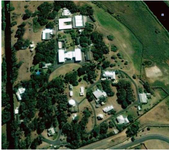
Figure 1: Google image of Royal Observatory. The H-shaped main building was completed in 1828.