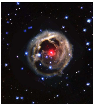
Figure 2. Optical image of V838 Mon and its light echo. The red central object is likely the product of a stellar merger, and the bright emission from this event is sweeping through surrounding interstellar dust, illuminating it and creating the appearance of a shell.