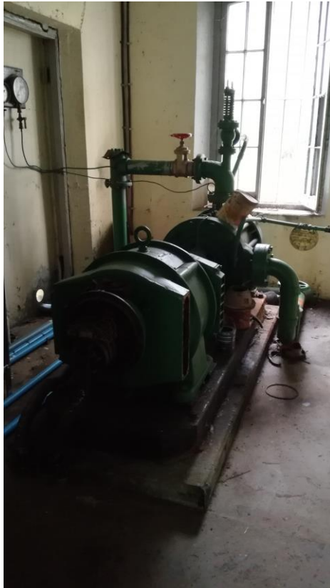
Figure 13 Existing Pump Room Equipment