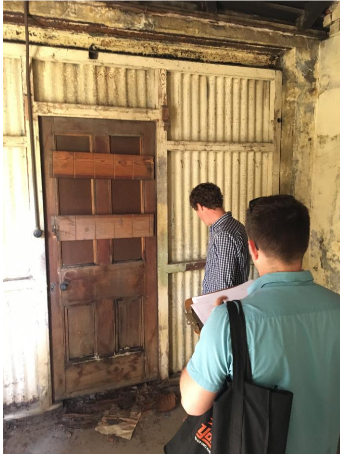
Figure 15 Location of Proposed Bathrooms