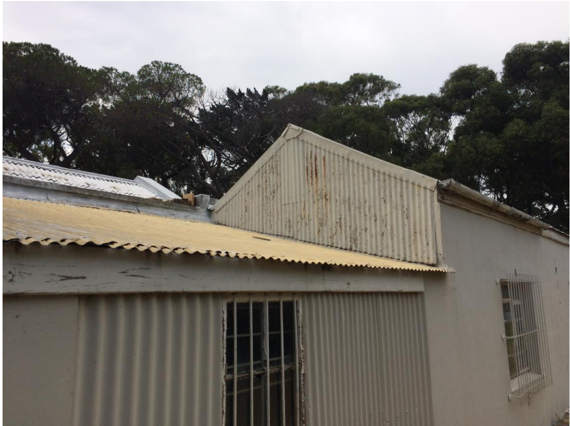
Figure 5 Existing Roof Condition above proposed Projector Room