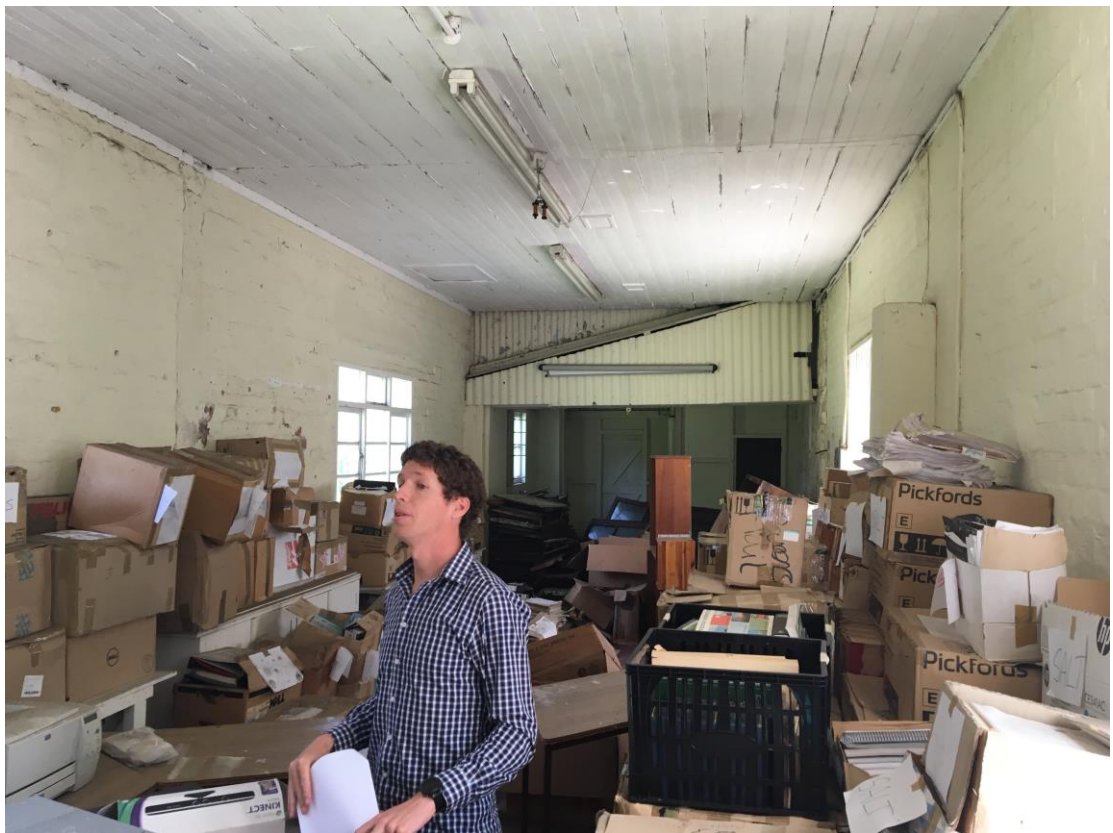
Figure 10 Location of Proposed Exhibition Space