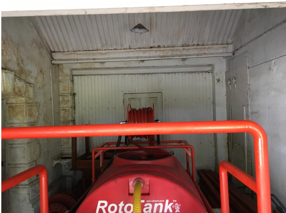
Figure 12 Existing Garage, to be converted to reception.