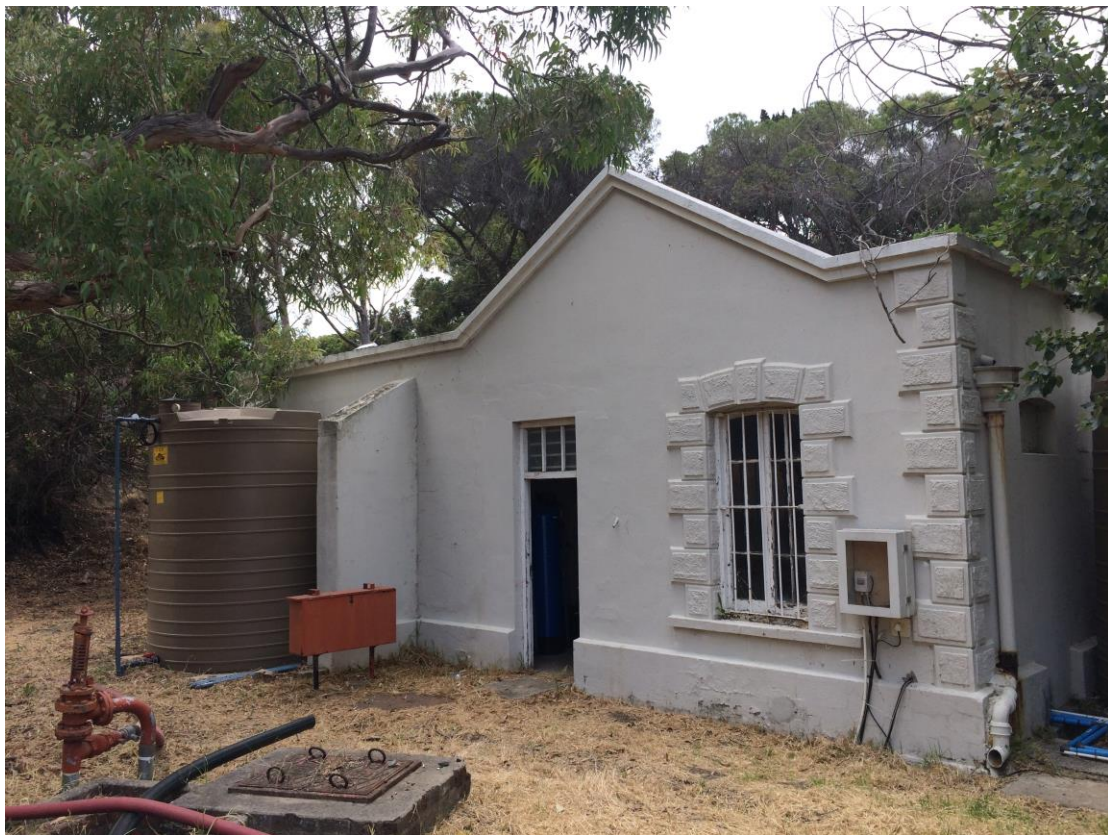
Figure 4 Back Facade