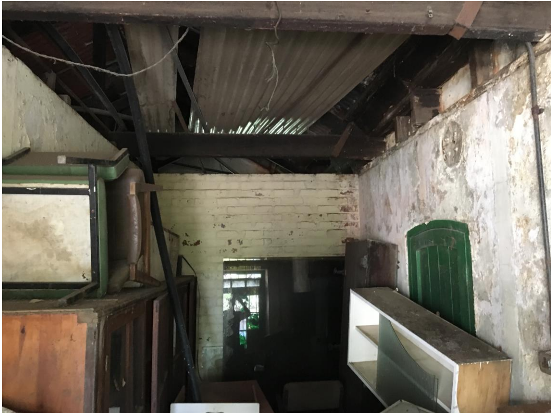
Figure 11 Existing walls proposed to be demolished to allow access to reception