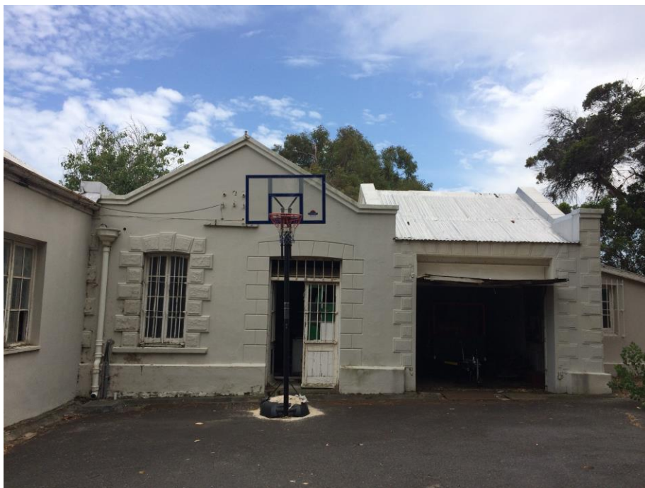
Figure 2 Front Facade