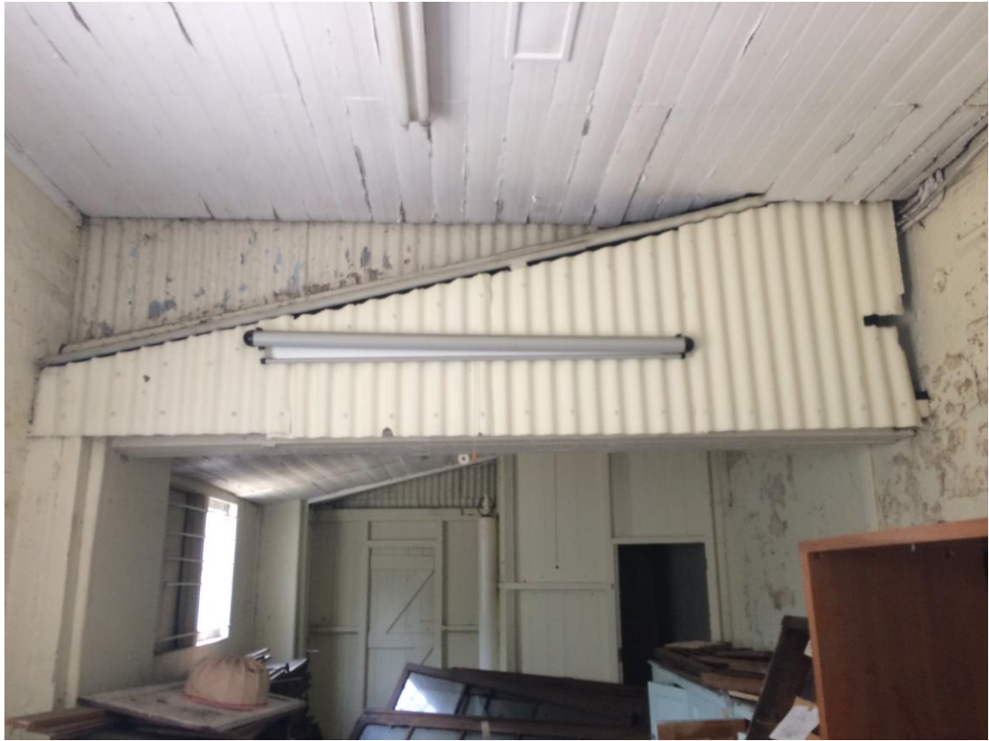
Figure 9 Existing room to be converted to projector room.