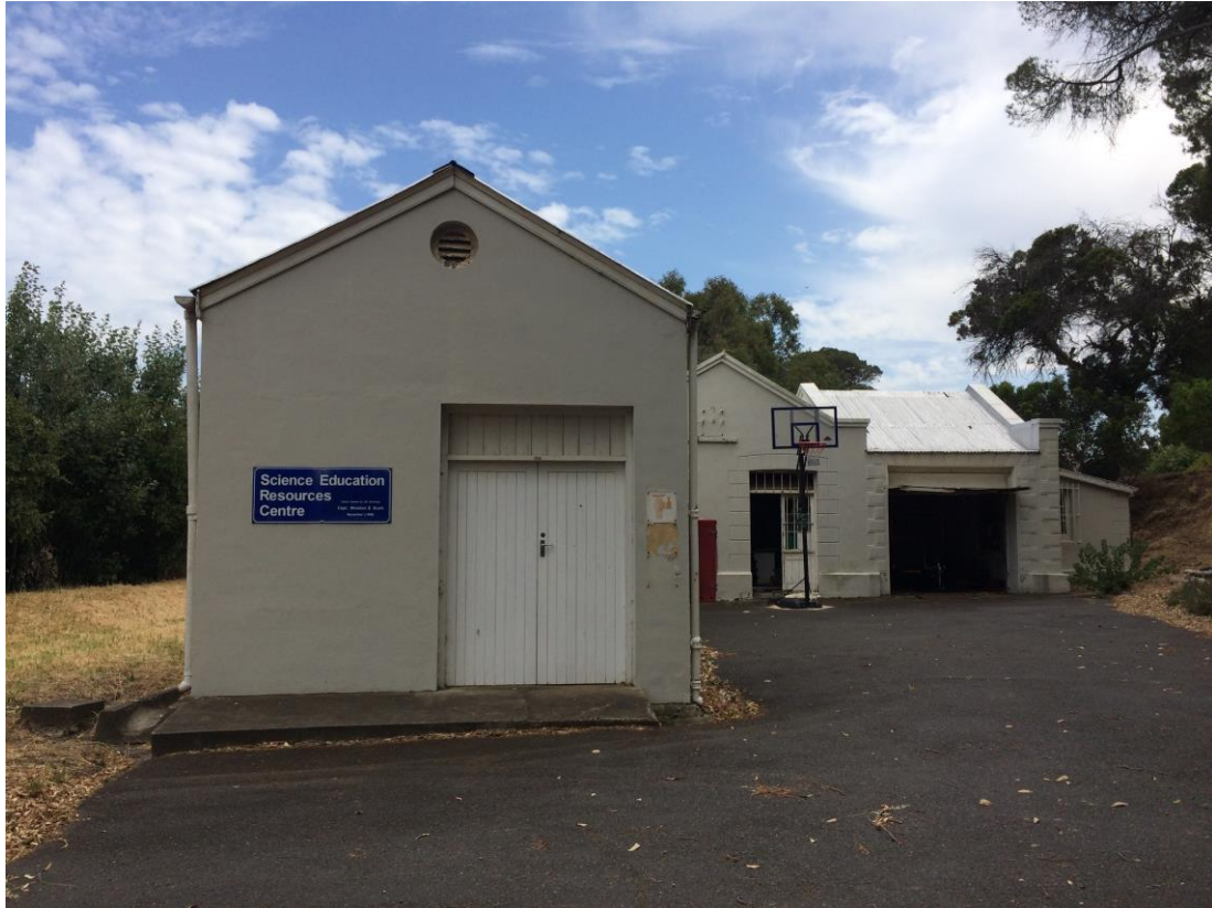
Figure 3 Front Façade