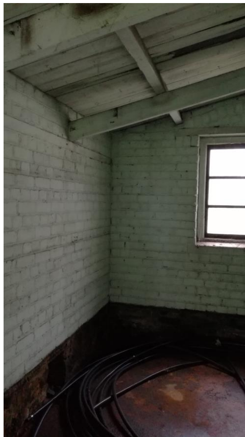
Figure 14 Location of proposed Heliostat Room