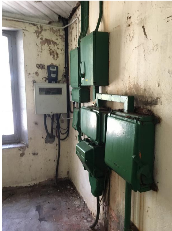
Figure 7 Existing Electrical Equipment and DB