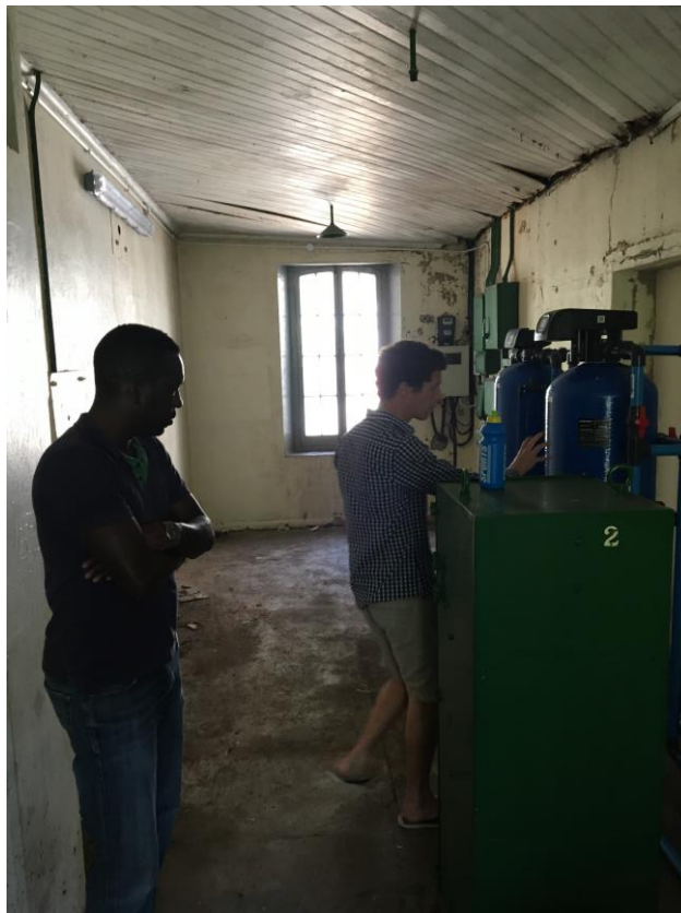
Figure 96 Existing Pump Room