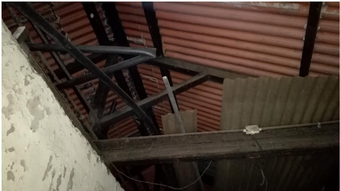
Figure 6 Existing Trusses to be preserved.