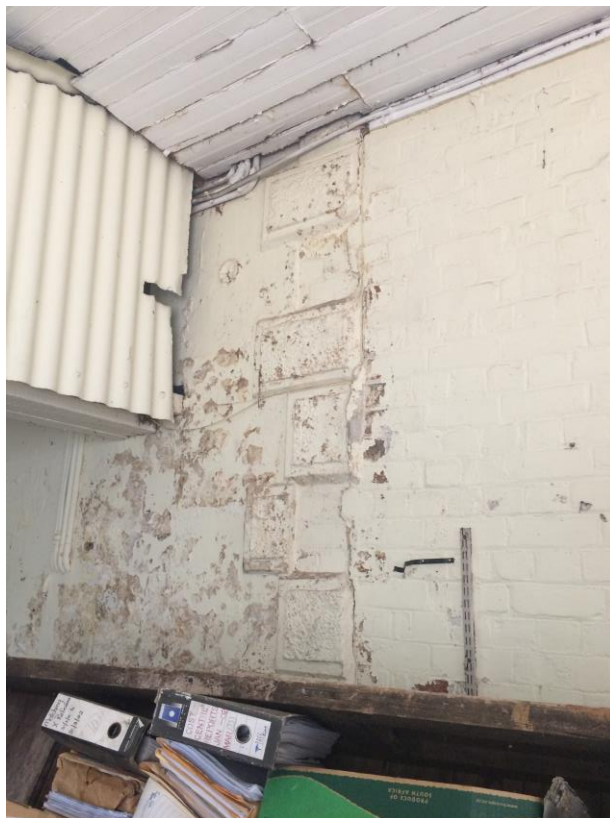
Figure 8 Walls in Proposed Exhibition Space